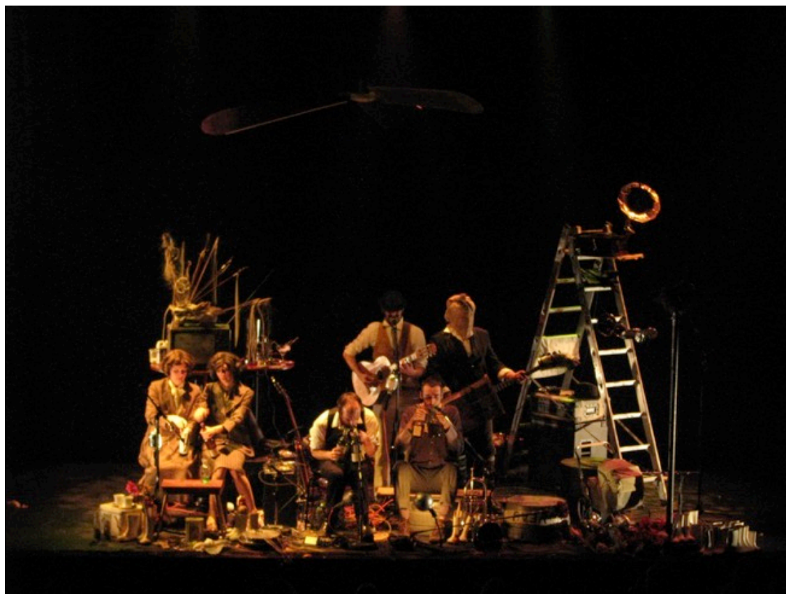
Wooden or metallic stepladder