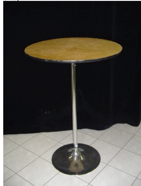
2 x Cabaret table