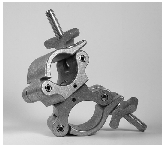
1 x Fixed cheesebofough, 2 swivel