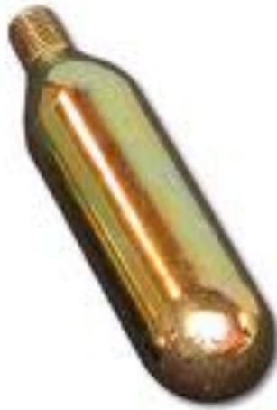
16 grams CO2 bottle