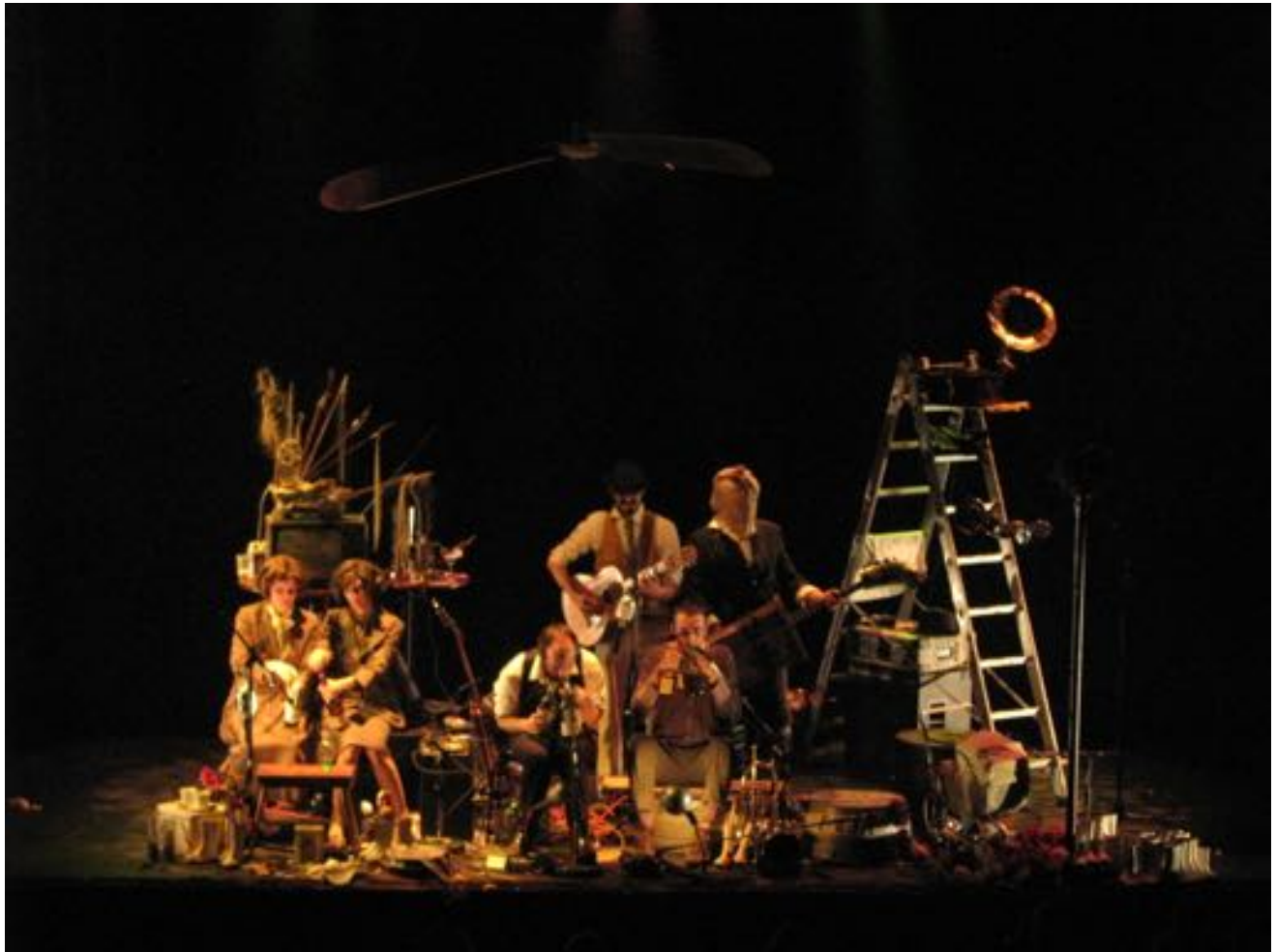
Wooden or metallic stepladder