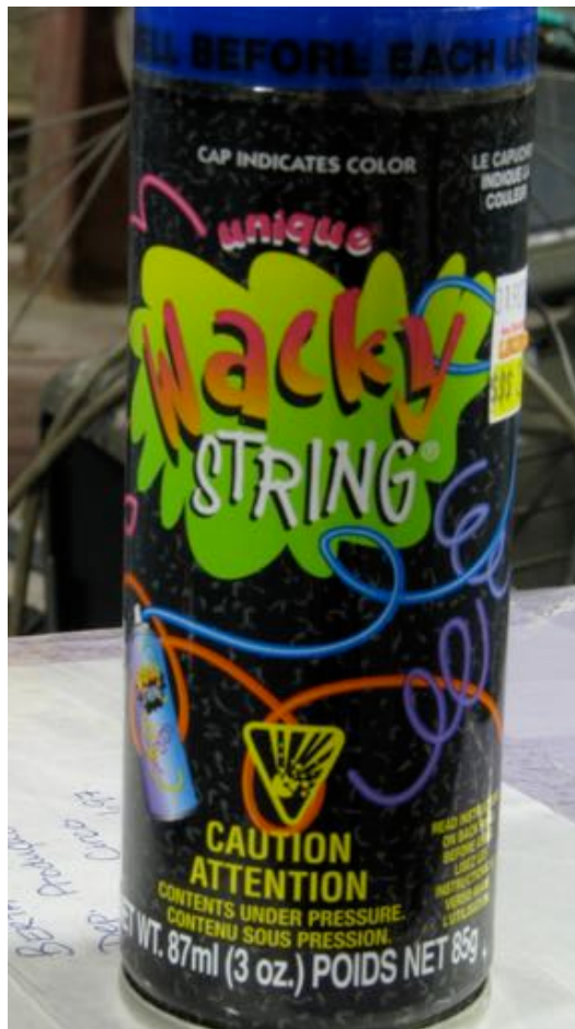
Wacky strings/Silly Strings